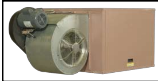
Blower Ductable Furnaces