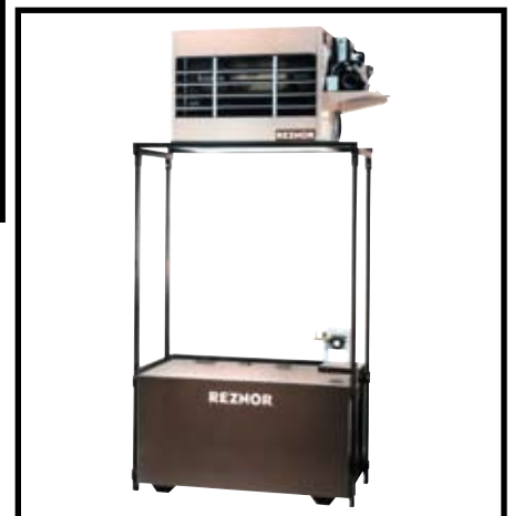
Recycling Center: Unit Heater, Workbench Tank and Heater Stand